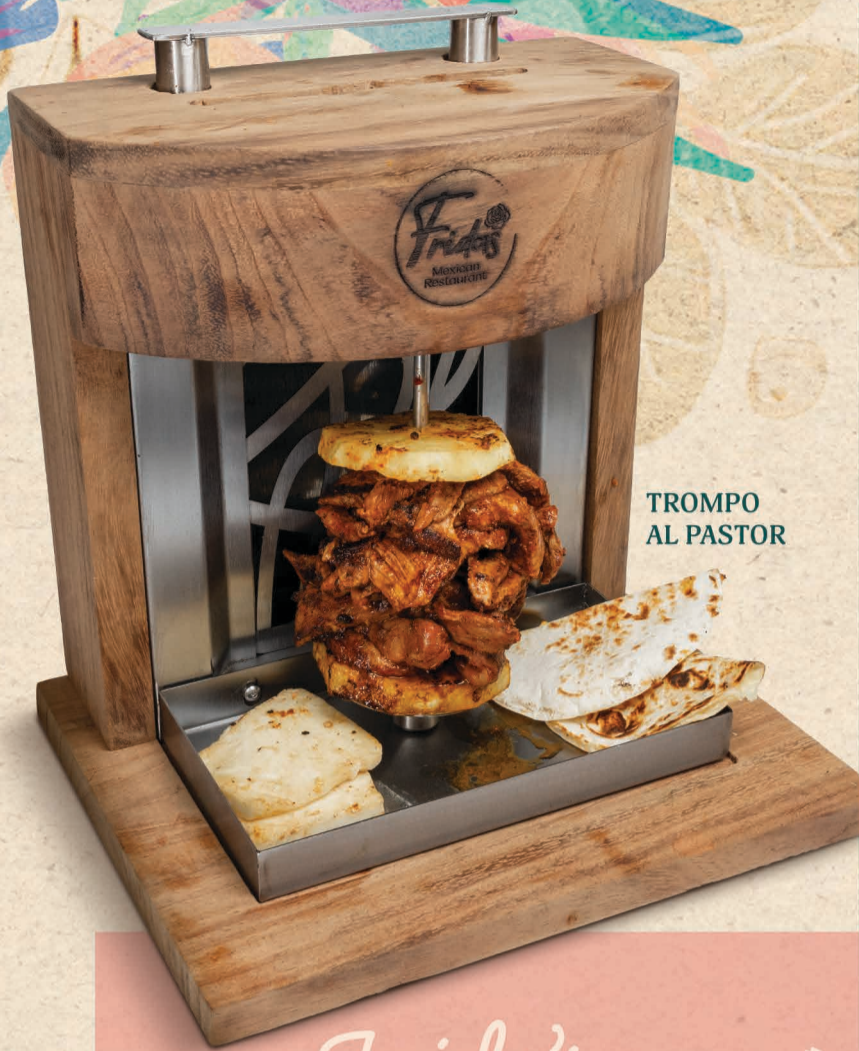
TROMPO AL PASTOR